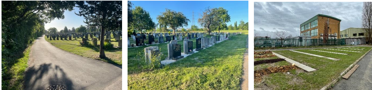
GREEN LANE ROADWAYS RE-SURFACED, SECTION X MEMORIALS REINSTATED, SECTION BX LANDING BEAM

Roadway on Green Lane perimeter The vehicle roadway on Green Lane perimeter was complete by FMConways in March 2022