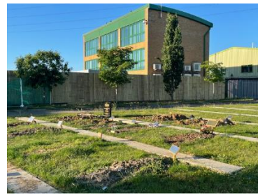
PERIMETER FENCING IMPROVEMENTS COMMENCED JUNE 2022 GARTH ROAD